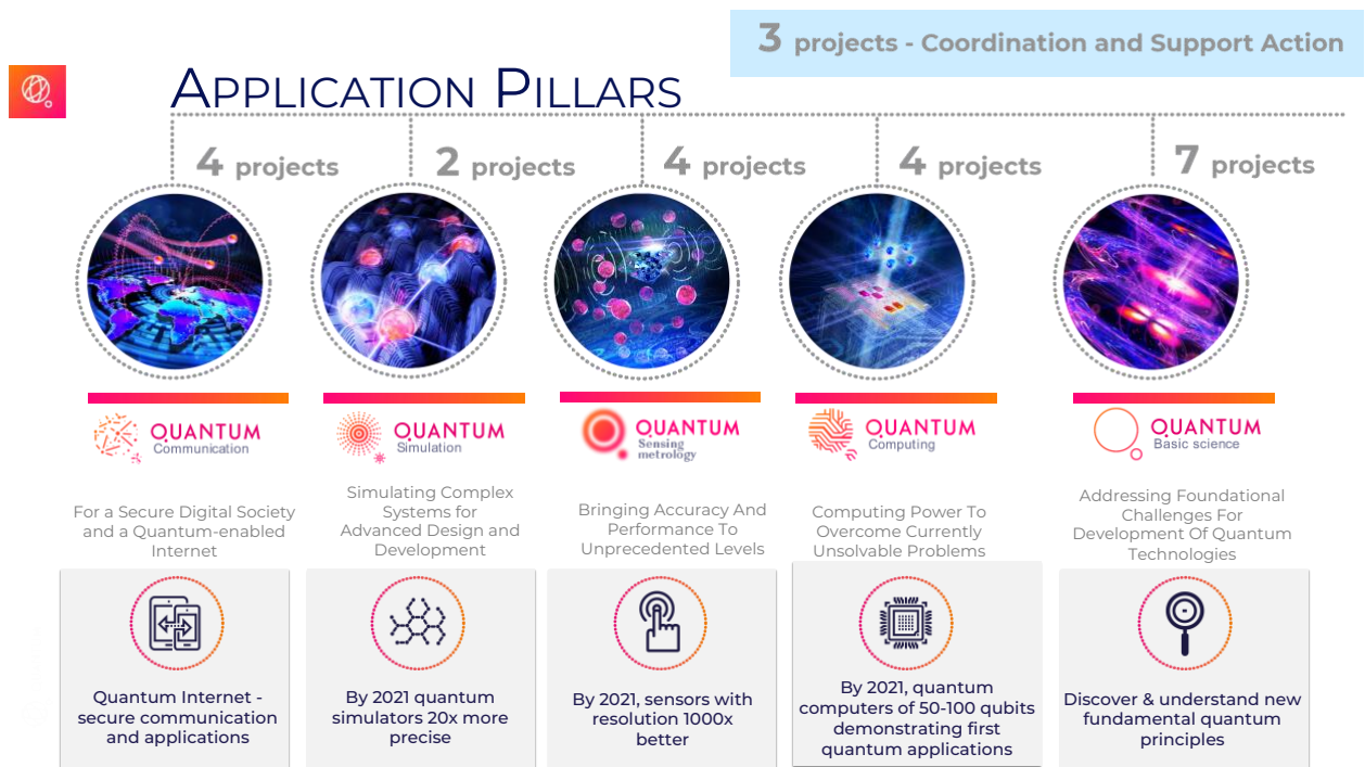
Figure 1: An overview of the ramp-up phase of the Quantum Technologies Flagship and the areas of the 21 scientific projects it finances.

The Flagship’s activities are shaped by its Strategic Research Agenda (SRA), originally drafted in 2017 and updated in early 2020 2 , under the supervision of the Flagship’s Strategic Advisory Board (SAB) and with input from over 2000 experts. It surveys the current state of play in quantum research and sets ambitious but achievable goals for the Flagship’s ten-year lifetime, with a focus on its initial three-year ramp-up phase. It structures the Flagship’s work around four mission-driven research and innovation domains, representing the major applied areas in the field: quantum communication, quantum computation, quantum simulation, and quantum sensing and metrology, supported by work in basic quantum science (See Fig. 1 below).